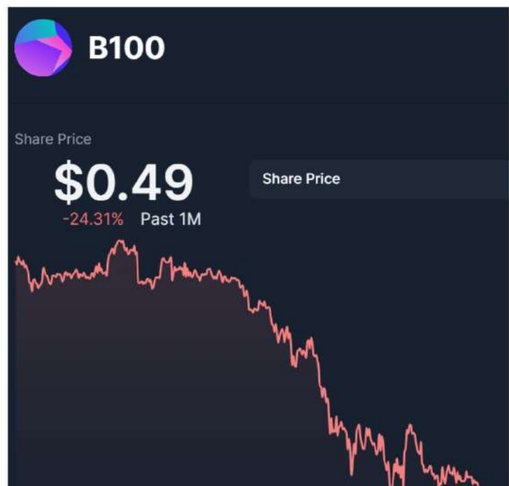
B100 Performance June 2022